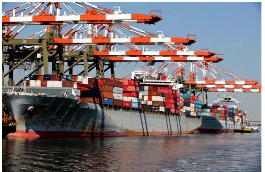
Ships in Newark Bay in New Jersey. The shutdown has slowed trade.

The U.S. government's partial shutdown is beginning to gum up trade.